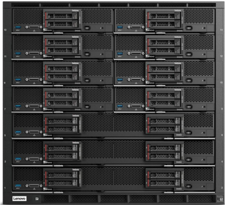
The Flex System Enterprise Chassis houses up to 7 SN850 compute nodes, delivering high density.

Flex System is a second-generation blade system that has helped customers streamline their infrastructure since 2012. The ability to run four generations of Intel® Xeon® processor-based blades concurrently in the same chassis, makes Flex System ready for the “future-defined data center”.