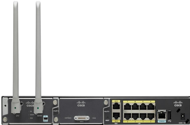
Figure 3. Cisco 800M ISR (C841M-4X) with WIM-3G and WIM-1T