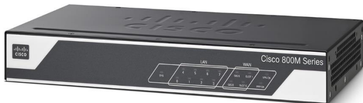
Figure 1. Cisco 800M ISR (C841M-8X)

The Cisco 800M Series platform supports pluggable Cisco WAN Interface Modules (WIMs) for flexible connectivity.